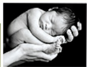
Max 6 days