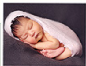
Jordana 4 days