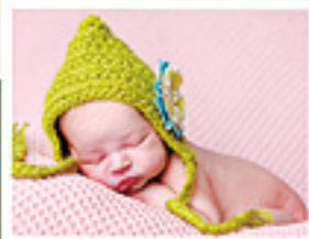
Lucy 10 days